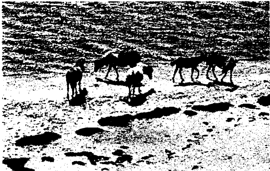
Wild Horses at Assateague Island