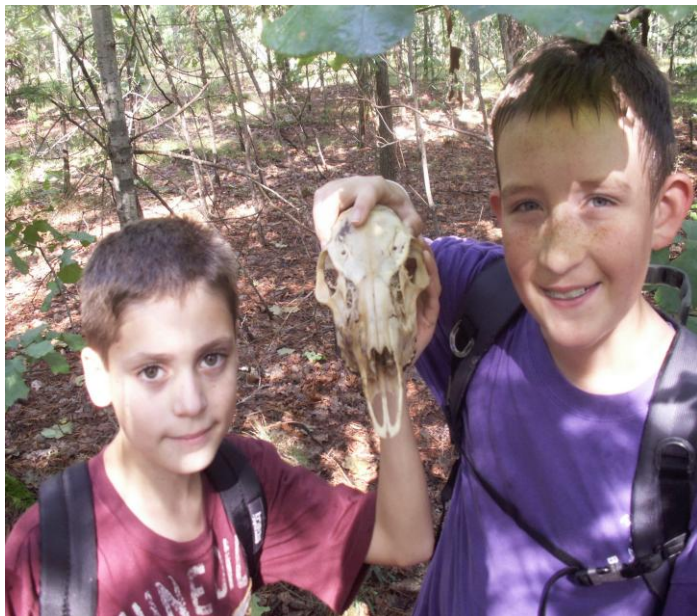
Discoveries on the Batona Trail!!!

Yard Sale Don't forget to bring your stuff to sell at our yard sale on the 10 th of October!