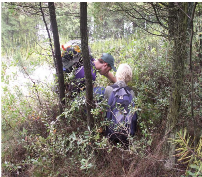
Sharing knowledge on Batona Trail

Don't forget to check out the Troop website for pictures, forms, the troop schedule, and much more! www.troop48berlin.org