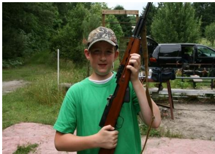
GUN DAY 2010