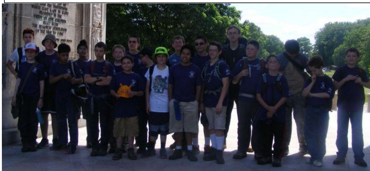
Hanging out at Valley Forge.