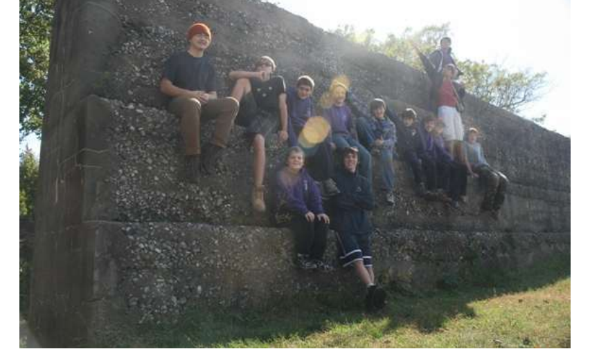
Blast from the past!

Troop 48 mucks it up in the mud on a camping trip in the Fall of 1967.